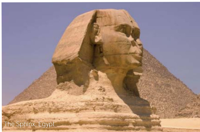
The Sphinx, Egypt