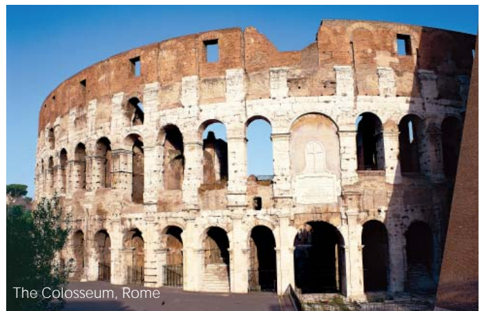
The Colosseum, Rome